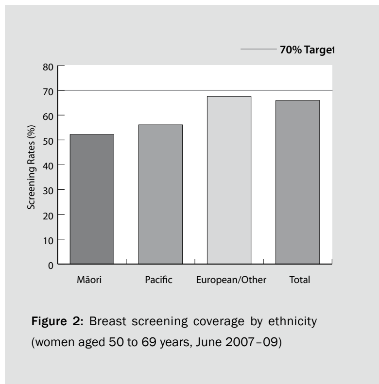
Figure 2: Breast screening coverage by ethnicity (women aged 50 to 69 years, June 2007–09)